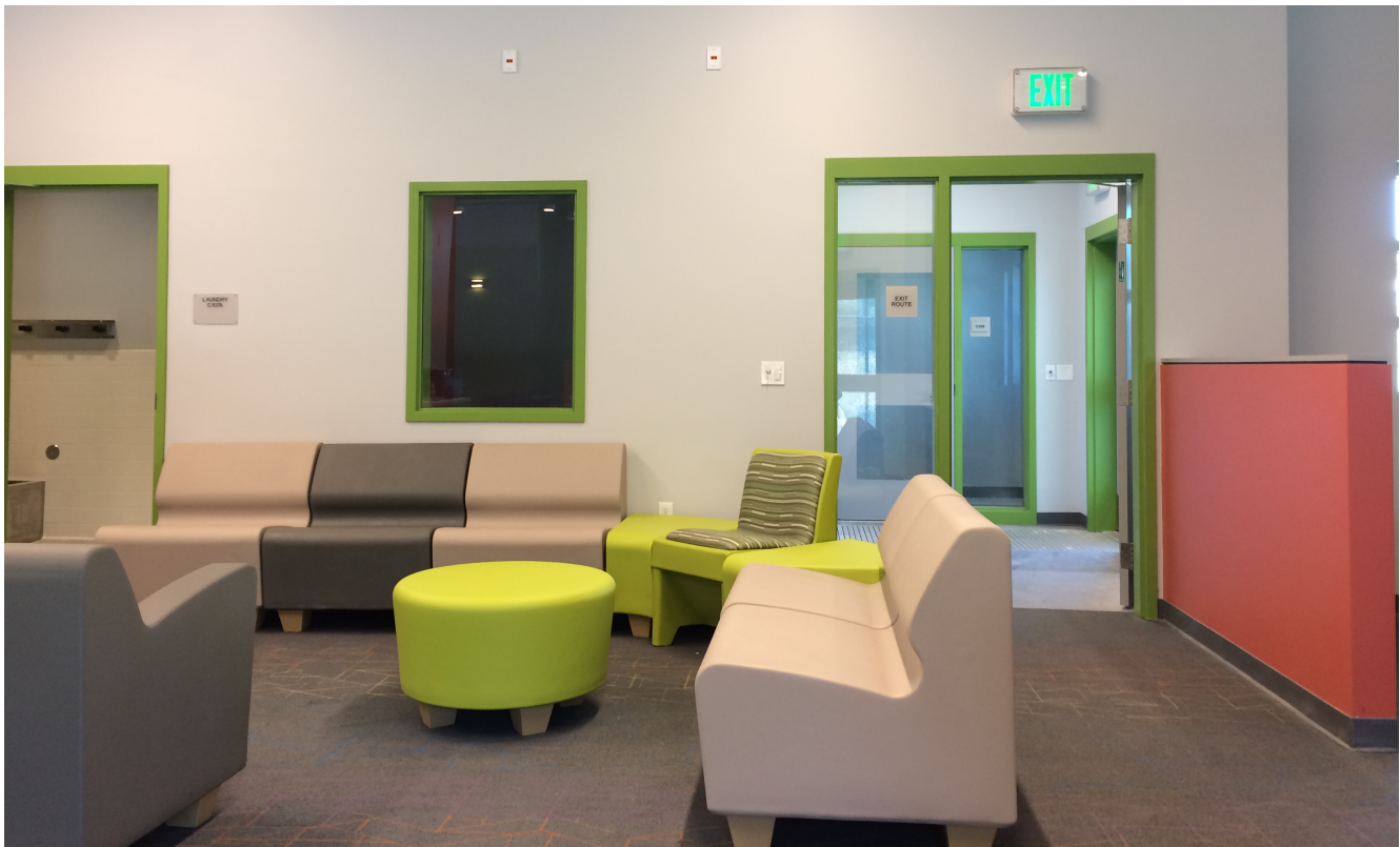
Campus Kilpatrick Renovation MALIBU, CA

The Not-to-Exceed fee shall be paid monthly on a Time and Materials basis according to our contract terms and conditions.