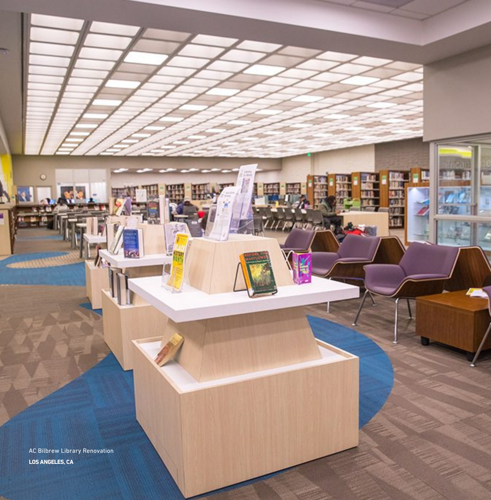
AC Bilbrew Library Renovation LOS ANGELES, CA