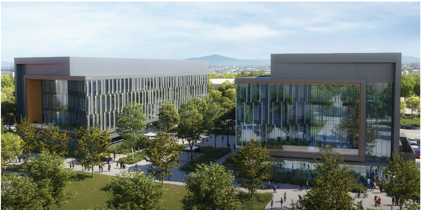
Harbor UCLA Research and Lab Facilities TORRANCE, CA

RWBID has reviewed the scope of work for the project described in the Request for Proposal. We have also reviewed the project's cost estimate and we've heard the City's concern to provide a right-sized project that is fiscally prudent. We are proposing the right technical staff and administrative services to accomplish the goals for the project, and we are ensuring that we are caretakers of this public funding. The following table identifies the services listed in the RFP that will be provided in-house by RWBID professional and technical staff. This table includes our approach to staff the project and identifies the staff with Primary (P) and Support (S) responsibilities to accomplish the scope of work.