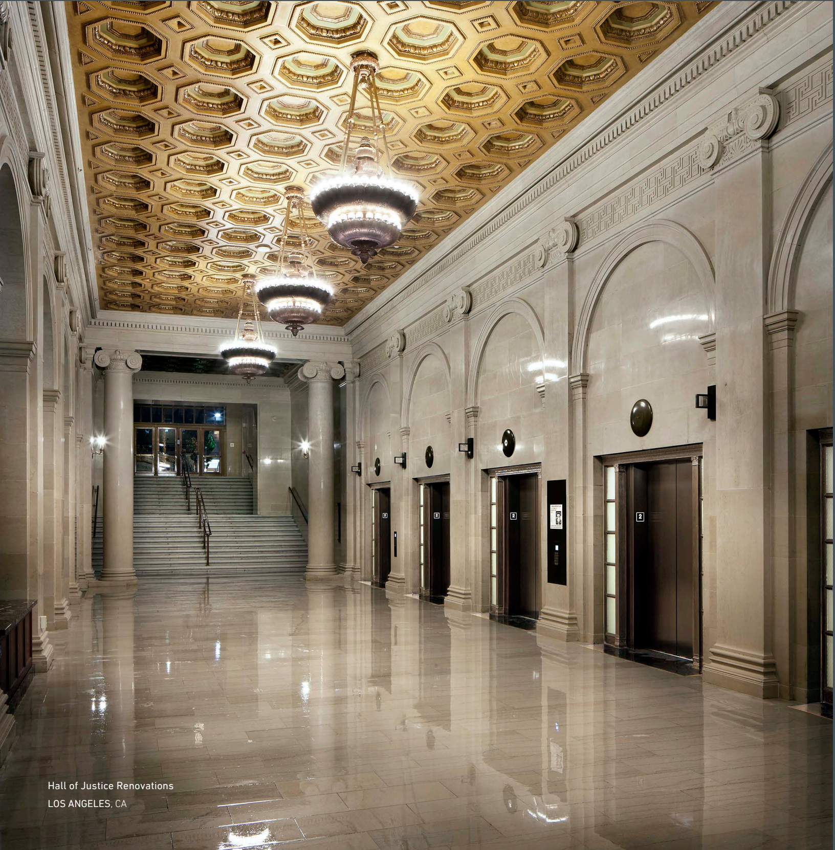
Hall of Justice Renovations LOS ANGELES, CA