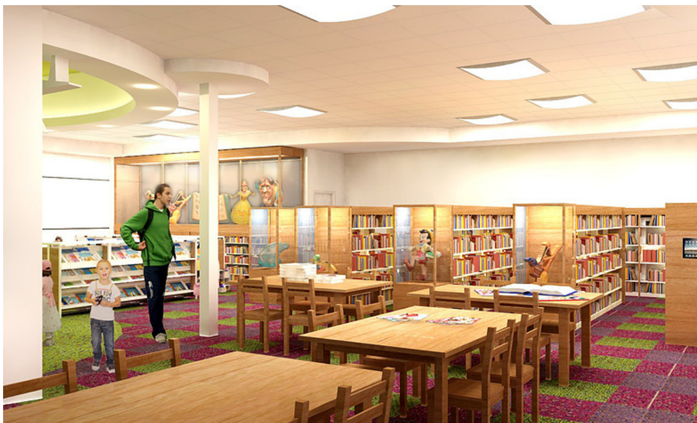
Stevenson Ranch Library Renovation STEVENSON RANCH, CA

RWBID has reviewed the scope of work for the project described in the Request for Proposal. We have also extensively reviewed the project's prior history and the City's concern to provide a right-sized project that is fiscally prudent. We are proposing the right technical staff and administrative services to accomplish the goals for the project, and we are ensuring that we are caretakers of this public funding. The following table identifies the services listed in the RFP that will be provided in-house by RWBID professional and technical staff. This table includes our approach to staff the project and identifies the staff with Primary (P) and Support (S) responsibilities to accomplish the scope of work.