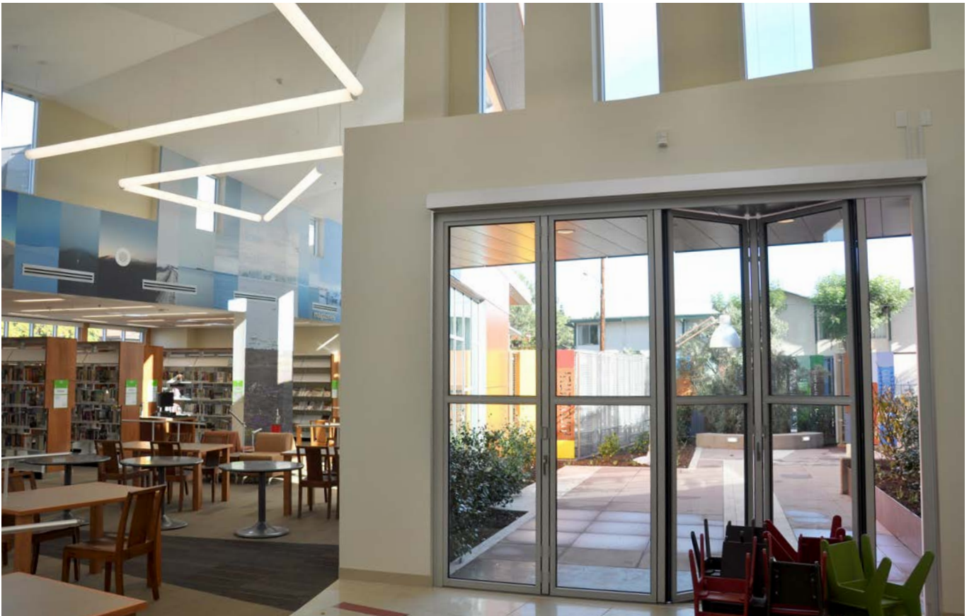
Pico Rivera Library Renovation PICO RIVERA, CA

In addition, if RWBID is selected to manage this project, the company will pledge to donate $10,000 to the Murrieta Public Library Foundation. The donation will highlight that our firm and our staff are dedicated to being good stewards of public and donated funds for the project. The donation would be scheduled to be made at the midpoint of the construction phase, should we be contracted for this project.