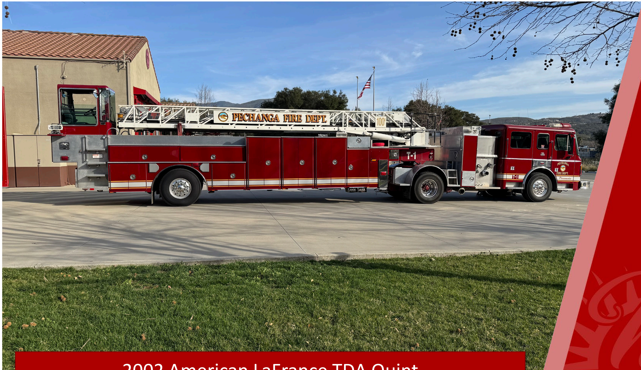
2002 American LaFrance TDA Quint