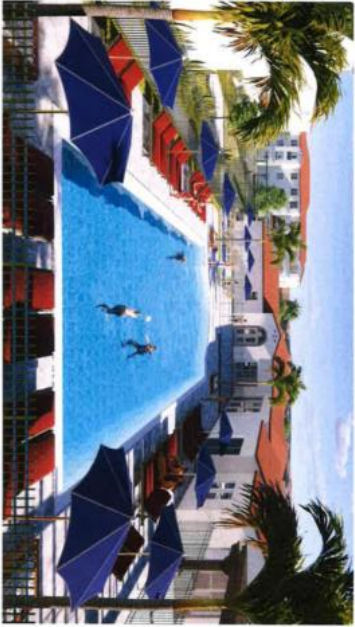
CLUBHOUSE LEASING REAR POOL SIDE 2