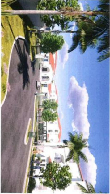
STREET ELEVATION WASHINGTON AVE. 1