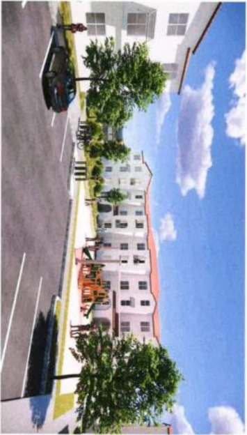
BUILDING 3C FRONT ELEVATION & TOT LOT 3