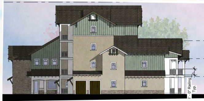
INTERIOR FACING ELEVATION