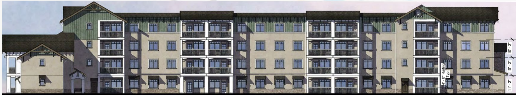
INTERIOR POOL FACING ELEVATION