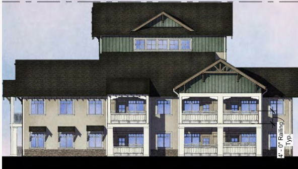
SIDE ELEVATION VIEW FACING ADAMS AVE