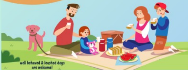
well behaved & leashed dogs are welcome!