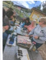
Seed starting workshop presented by a UCANR master gardener