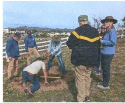
Fruit Tree Planting demonstration

Farm assessment conducted by the ag irrigation tech from Mission RCD has identified several areas that need improvement in the orchards including irrigation delivery, water pressure and soil health. Cultivating Inclusion will be working with TEAM RCD and USDA Natural Resource Conservation Service (NRCS) on these issues in the near future.