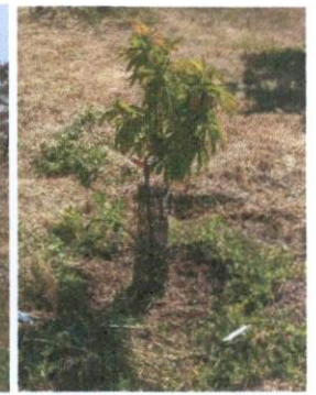
Young nectarine, 5 months later