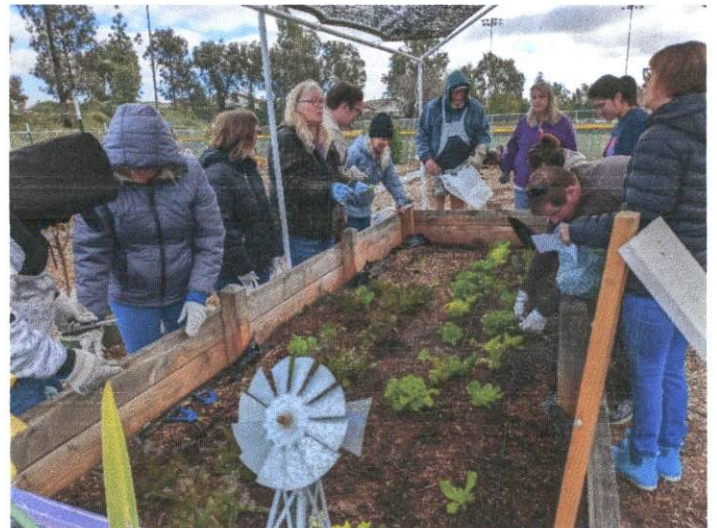
Harvesting lettuce at Cultivating Inclusion Farm, photo taken in Jan 2024

The survey results from 6 local food pantries reveal the needs for good quality produce and the types of produce desired by their customers. Cultivating Inclusion has taken the feedback into consideration when selecting what to grow this spring such as tomatoes, squash, zucchini, cucumber and potatoes. Our survey of job coaches resulted in 37 responses that are very helpful in future program planning such as popular activities and challenges experienced by our special needs participants. Thank you to those who provided the valuable feedback!