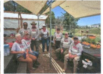
TEAM Rubicon volunteers