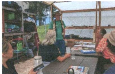
Pollinators workshop presented by a biologist from California Department of Fish and Wildlife

Two workshops were organized for Cultivating Inclusion volunteers by the Mission RCD Natural Resources Program Manager. We learned the how-to guide for starting and germinating seeds and about native plants and pollinators.